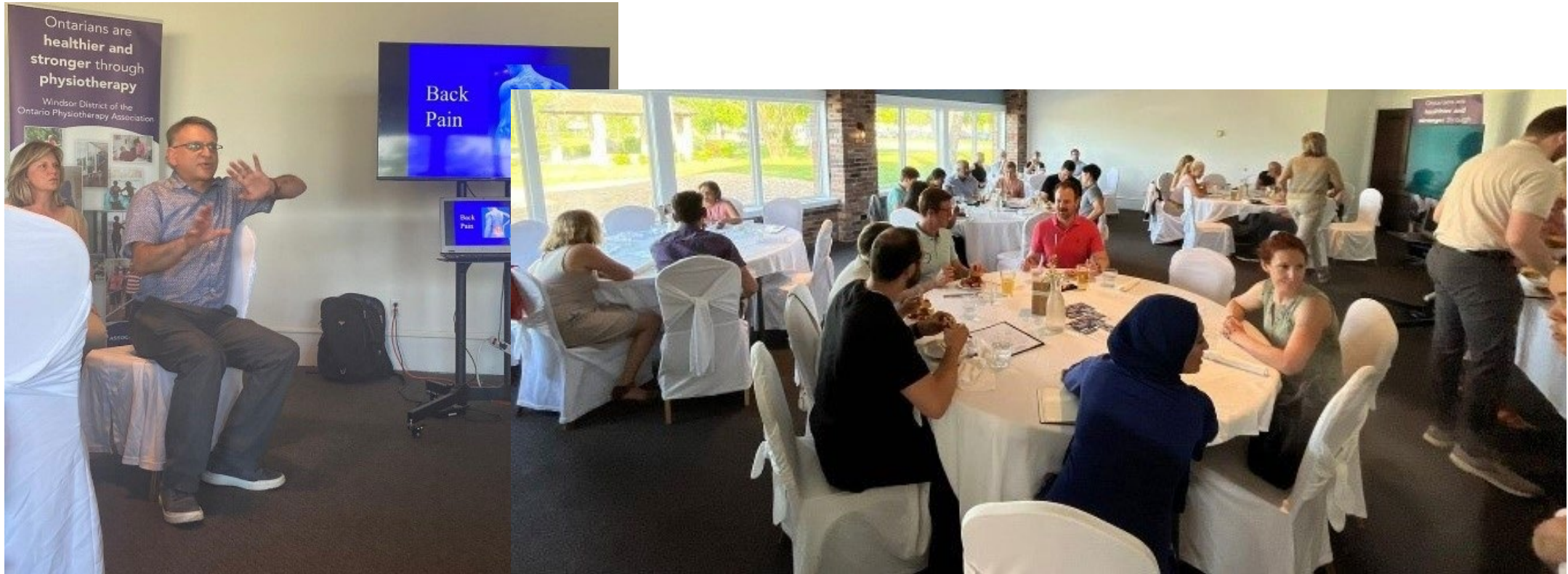
Windsor District Speaker Series – In-person!