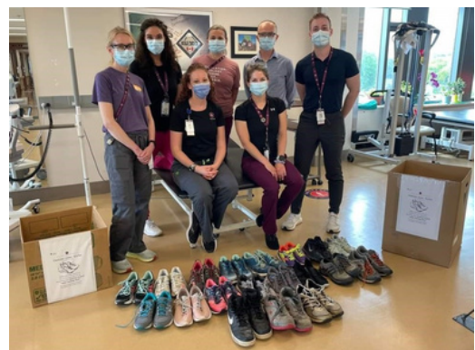
Windsor District Donate Your Kicks Campaign

Windsor District ran their Donate Your Kicks Campaign, Central Toronto District ran a course and a virtual talk for NPM and Grey Bruce District Hosted "May Moves Me" gathering members across the district for a fundraising walk.