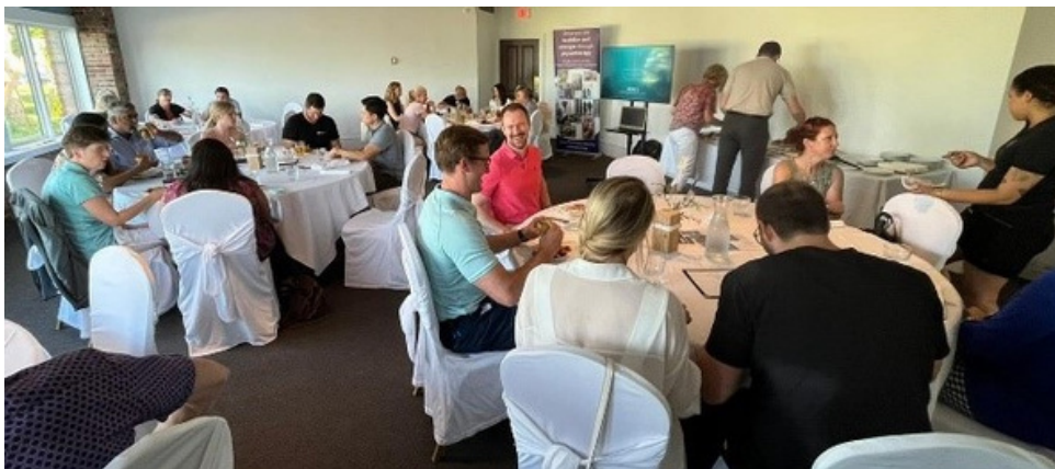
Windsor District Speaker Series